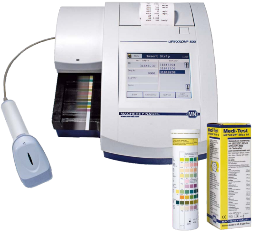
Medi-Test URYXXON® Stick 10