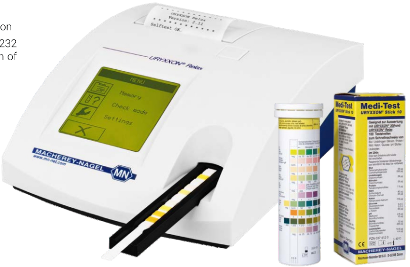
Medi-Test URYXXON® Stick 10